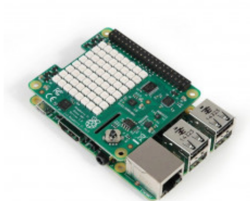
Shown installed on Pi (not included).