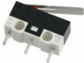
Mini Micro Limit Switch Ultra Small 1A